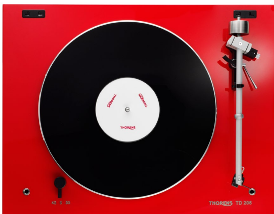
THORENS® TD 206

Installation is quick and easy: getting the deck set up and playing the first bars of music from a spinning record is a matter of minutes. Both models come with a pre-installed to-earm complete with a high-quality MM pick-up cartridge, interconnects and even a spirit level and a stylus balance. Both models, including the THORENS® TP 90 tonearm, are manufactured in Germany.