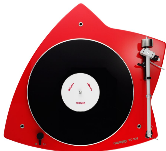
THORENS® TD 209